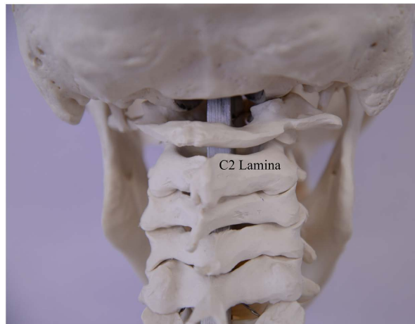
Figure 1. Posterior spinal anatomy.

lying down and by pressure on pillows to the back of her head. She reported partial and short-lived relief from simple oral analgesia including paracetamol and ibuprofen. There was no history of trauma to the head or upper cervical area.