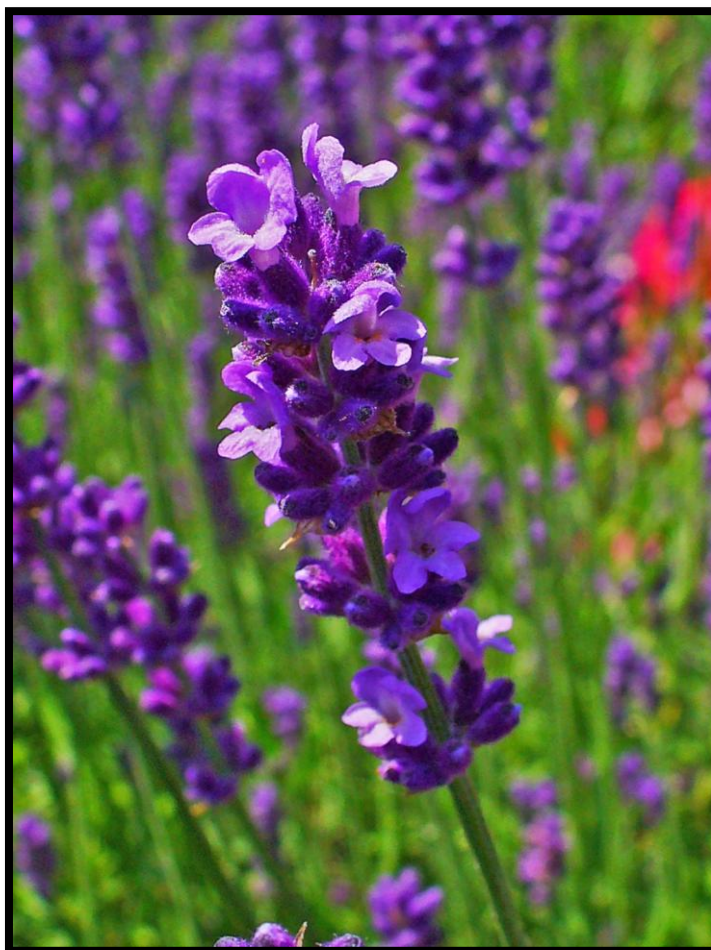
Fig. 1. Plant morphology

The plant is a semi-woody, evergreen, perennial plant with lanceolate leaves covered by tomentum, square stem curled at edges. The inflorescence is spike like and has bright purple flowers that are important ornamental blooms. The plant is native to Spain, and some neighboring countries but now naturalized in India. This plant requires fertile loamy soil, and it is propagated vegetatively as well as by seed. The flowers have excellent flavor properties and sell as sachets. The plant possesses majestic flowers that are known for their aroma and used as cut flowers and have various bioactive compounds of economic importance. [Heral et al. 2020]