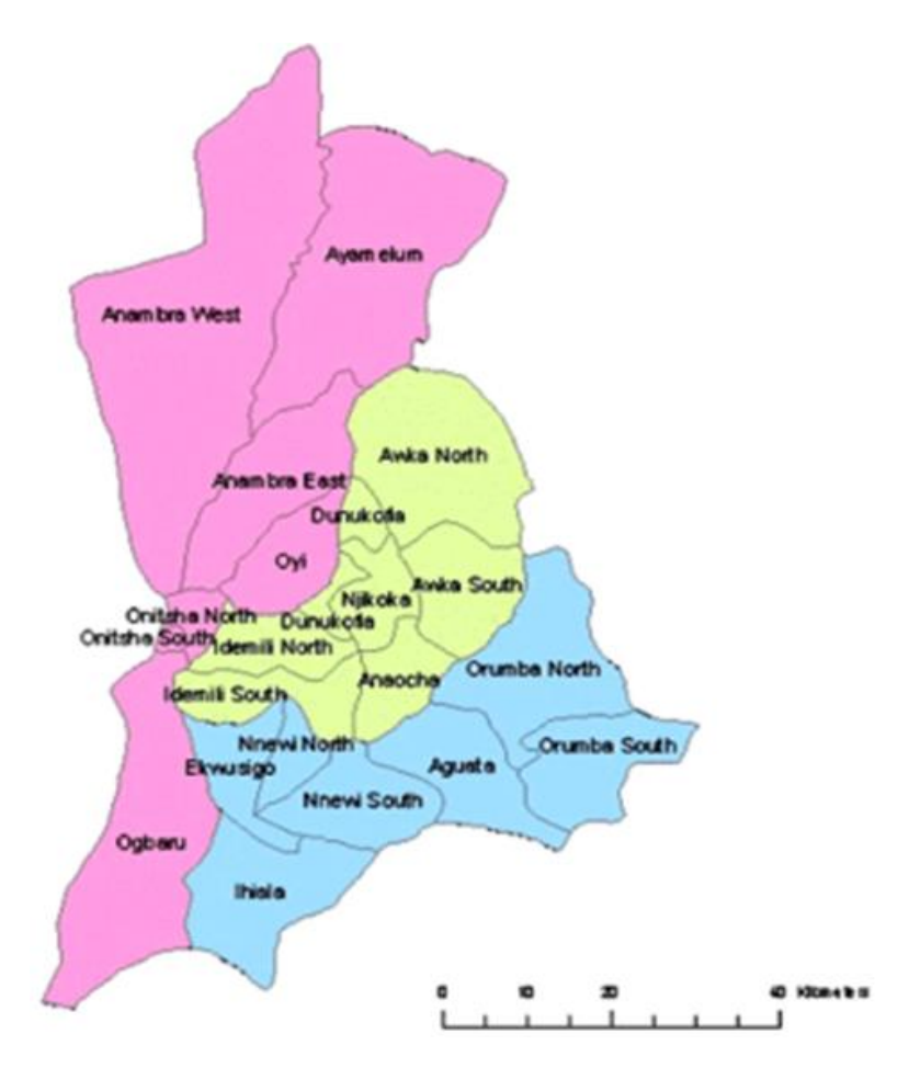
Fig. 2. Map of Anambra state showing the local government areas Source: [28]