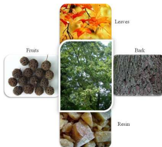
Fig. 1. L. formosana and its' various organs

been used traditionally for the treatment of flutter injury, ulcer throat, vomiting, epistaxis, and trauma bleeding in China [2].