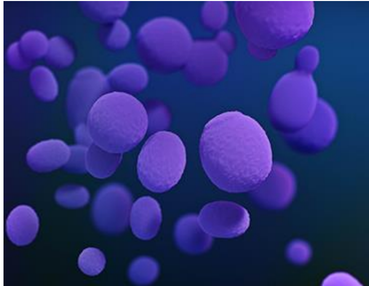
Fig. 1: Medical illustration of Candida spp., presented in CDC's Antibiotic Resistance Threats in the United States, 2019. (Peters et al. , 2013).

Research the presence of pleasing microorganisms and guarantee that the protected framework is working appropriately to fight infection (Furlaneto et al. , 2011). Candida abundance issue is a word used expecting contamination. Candida congests the body and is an ongoing issue where an individual turns out to be extremely touchy to explicit food sources like dairy, eggs, corn, and gluten. Candida guilliermondii is a disputable Candida animal variety that is once in a while connected to onychomycosis. On twin 80 agar corn flour and at 26 C following 64 hours, states are immersed, smooth, and level, with a yellowish dominating, and are not a lot and length. Candida parapsilosis has unsafe irritates of 2.5-4 micrometers and is the most widely recognized yeast in medical care offices. It is recognized in clinical advantages laborers and contamination with C. parapsilosis is brought about by postponed catheters. Infant youngsters are often the difficulties, and victims are given up to the cautious focus mind unit. Candida famata is a yeast that can be found in food collections, especially dairy food varieties, and is somewhat uncommon. Candida kefir is a sort of yeast that colonizes the lungs and vascular structure of people with cutting-edge leukemia. The ovaries, as different plants in the human body, are answerable for infections that create in explicit spaces of the body, for