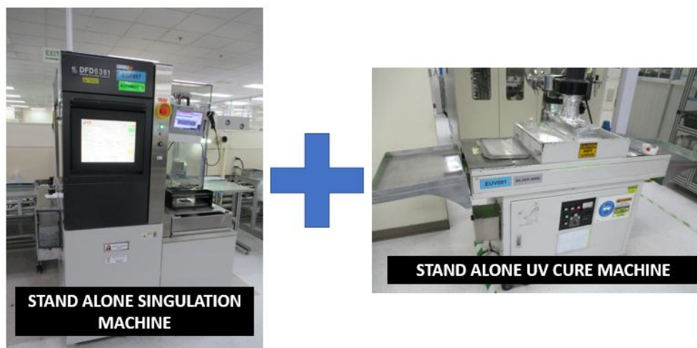
Fig. 2. Separate machines of sawing and UV cure

Through the series of studies conducted on methodology, it has been found out that the performance of cured UV tape at pick and place using the simplified process has no significance on the performance produced on the separated stand-alone machines of singulation and UV cure.