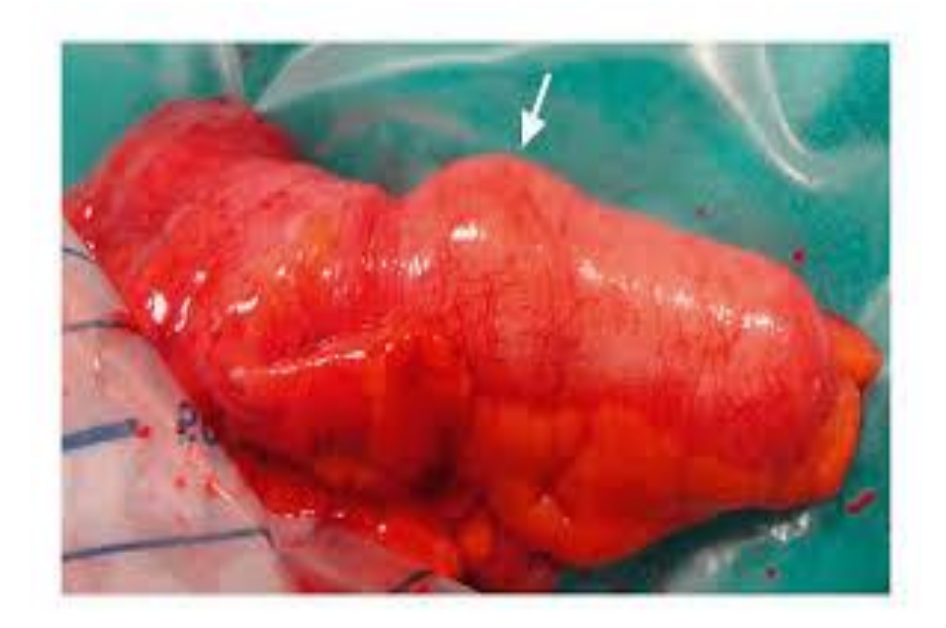
Fig. 2. Neuroendocrine Tumor (NET) of the appendix, arrow shows the bulbous distension in the area of the appendix