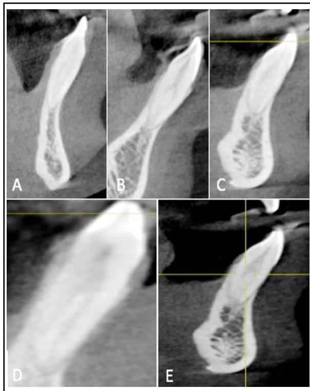
Fig.1: Mandibular incisors CBCT images with A- Type-II, B- Type-III, C- Type-IV, D- Type-V and E- Type-VII.

Type-VI, VII and VIII canals showed no significant differences. (Table-I) The prevalence of oval shaped canals in Type-I and III canals at apical third level is shown in Table-II. The prevalence of oval canals was significantly higher in Vertucci Type-III canals (80.1%) as compared to Vertucci Type-I canals (32.2%) ( p < 0.05 ) (Fig.2). 46.6% mandibular incisors exhibited oval canals. For both mandibular CI and LI, the prevalence of Type-I canals was significantly higher in males than as compared to females ( p < 0.05 ). However, the prevalence of Type-III canals was significantly higher in females than as compared to males ( p < 0.05 ). There were no significant differences