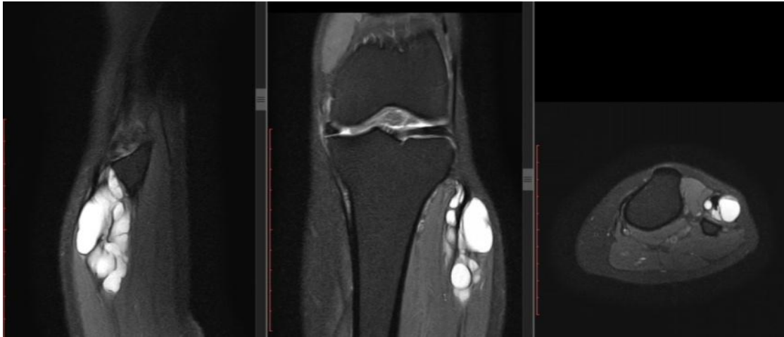
Fig. 4. Sagittal, coronal and axial T2 weighted MR images showing multiloculated cystic lesion at level of the neck of fibula, lying in the muscular plane with no communication to the joint

Indication of surgery in our case was to relieve symptoms due to nerve compression. Intra-operatively it is necessary to remove the complete bulk of tumour with surrounding normal soft tissue excision in order to ensure complete removal of the cyst with its coverings to prevent recurrence. Excisional biopsy is deemed necessary to confirm diagnosis and to rule out any chances of malignancy. The contralateral leg had similar ganglion cysts but as the nerve was passing between the cystic lesions, the patient did not have any complaints in the left leg. On follow up after 6 months, the patient has significant relief in pain and has partially regained her motor power.