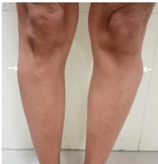
Fig. 1. Clinical image of the patient showing swelling in anterolateral compartments of both legs. The swelling was soft in consistency, compressible with restricted mobility

antibiotics. At 1 month follow up, patient had substantial improvement in pain and heaviness of the legs. Her foot drop gradually improved to near normal with physical rehabilitation over a period of 3 months.