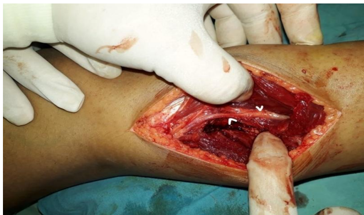
Fig. 5. Intra-operative picture showing intact common peroneal nerve (arrowheads) after excision of the cyst

uncommon location of a very common benign tumour which was diagnosed using high resolution ultrasound. The cysts were present bilaterally but unilateral symptoms were explained by ultrasound and MRI which showed stretch of only the right sided nerve while the left one was spared as it traversed between the cystic locules. Literature search revealed case reports [12,13,14] on common peroneal nerve palsy due to ganglion cysts but none of them had an imaging approach to diagnosis. The reported cases were of unilateral compression of the nerve, while bi-laterality of cysts with unilateral symptoms make our report unique. We also report the advantage of using imaging in diagnosis of peripheral neuropathy.