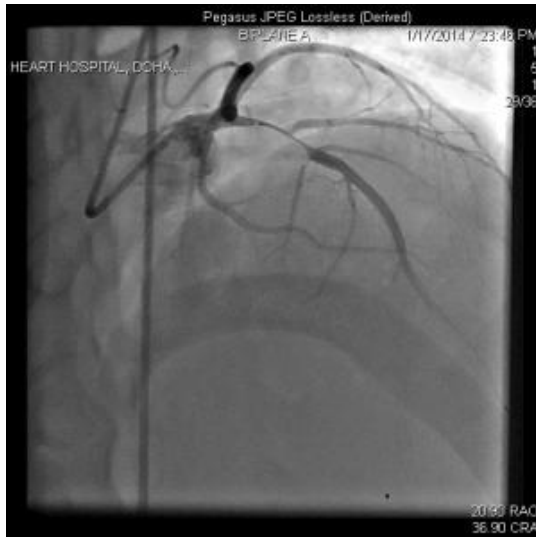
Fig. 3. Pre-Percutaneous coronary intervention (PCI)

He was found to have acute anterolateral myocardial infarction without no electrolyte disturbance or hyperlipidemia. He underwent primary percutaneous coronary intervention (PCI) to the proximal left artery descending (LAD) lesion (95%) with thrombus aspirated with export catheter (Figs. 3 and 4) and predilated with 2.7 X 2 cm balloon (percutaneous transluminal coronary angioplasty) and 3.5 X 24 mm bar metal stent (BMS) deployed in the LAD.