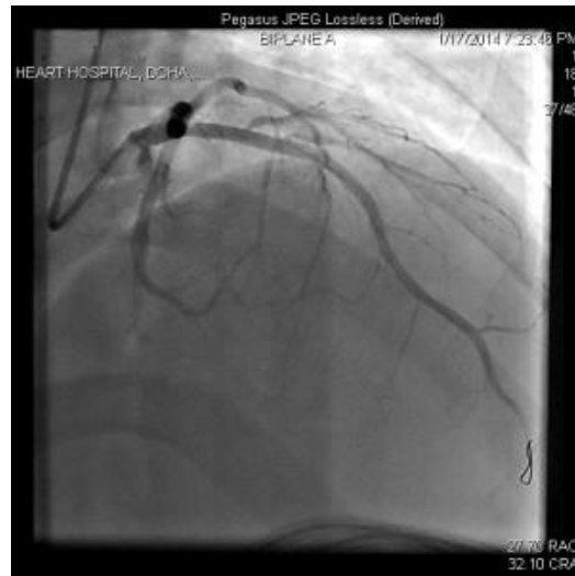
Fig. 4. Post-PCI (Post-angioplasty)

The case was discussed in thoracic multidisciplinary team meeting for an alternative option of treatment as the patient refused any further chemotherapy. The tumor size is huge to be surgically re-sected or to be irradiated so it is recommended changing the combination chemotherapy with less cardio-toxic medication.