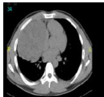
Fig. 2. Chest CT scan